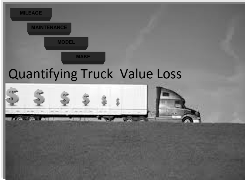
EAANA 2013 Annual Membership Meeting